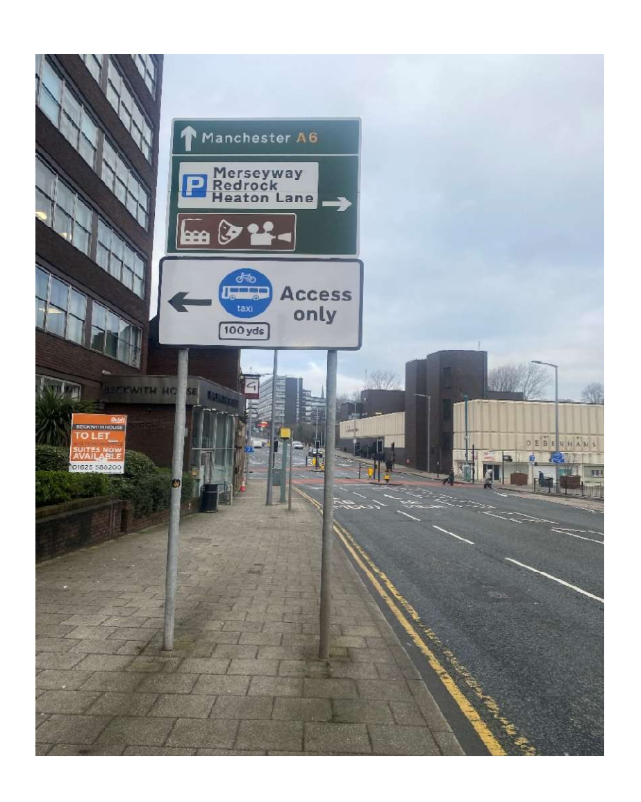
Figure 1: A6 Wellington Road North – Northbound (Heaton Lane jct approach)